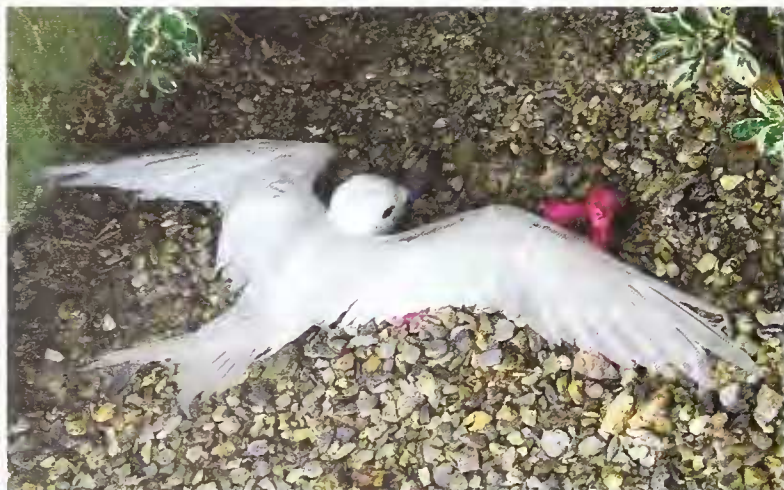
Plate 7. White Tern Gygis alba , Romblon Island, Romblon, 18 September 2012.